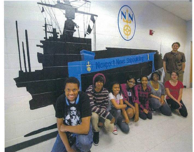
Heritage High School students stand in front of the NNS mural they painted in the school's main hallway.