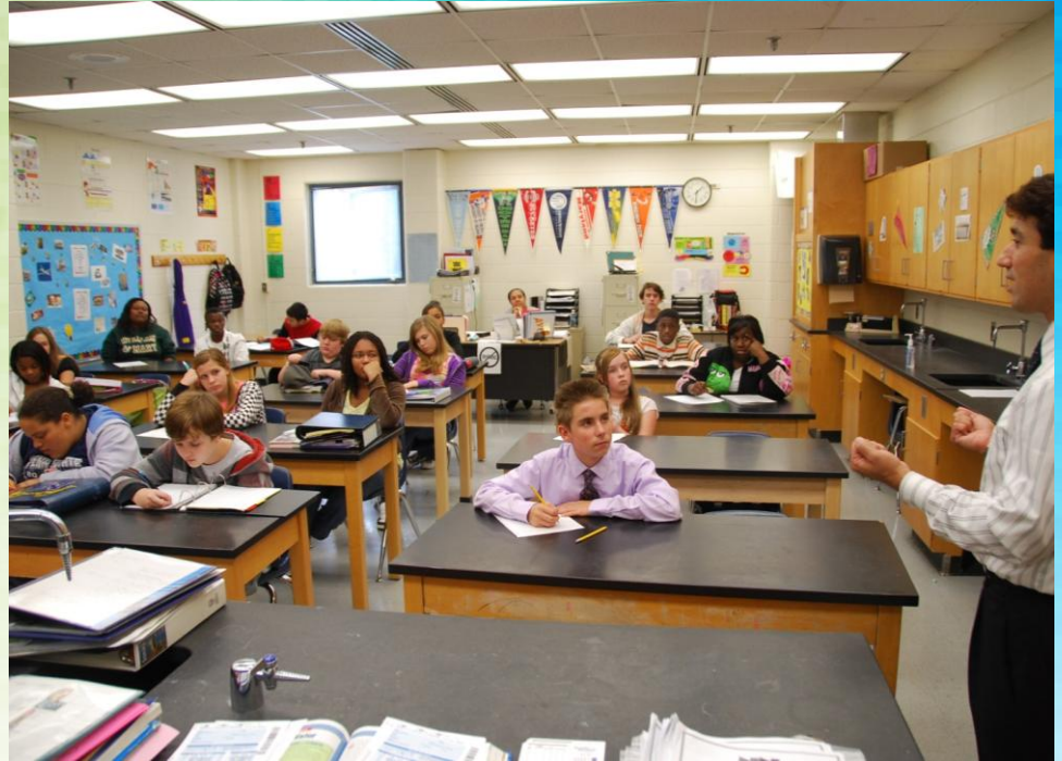
Middle school students take notes during a presentation on financial careers by a local banker.