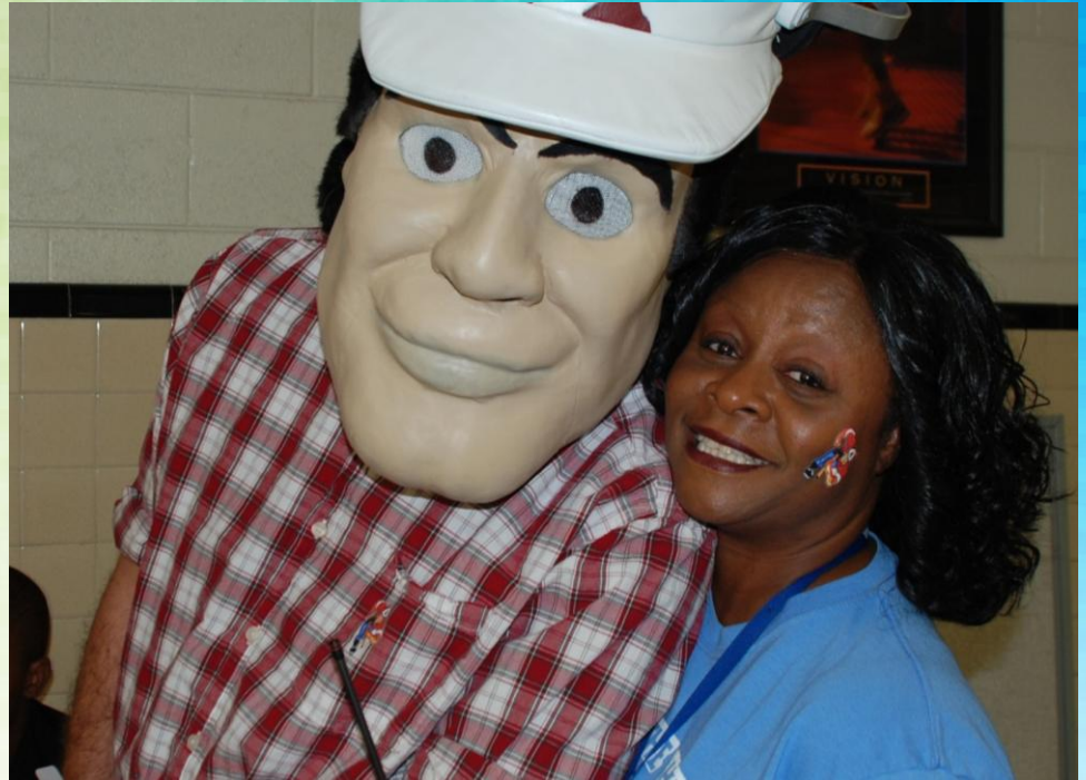
The Newport News Shipbuilding Apprentice School mascot makes an appearance at Huntington Middle School for a Career Pathways Activity.