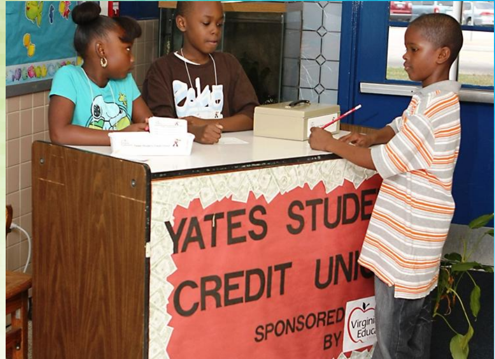
Virginia Educators Credit Union sponsors student branches at Yates Elementary and Menchville High