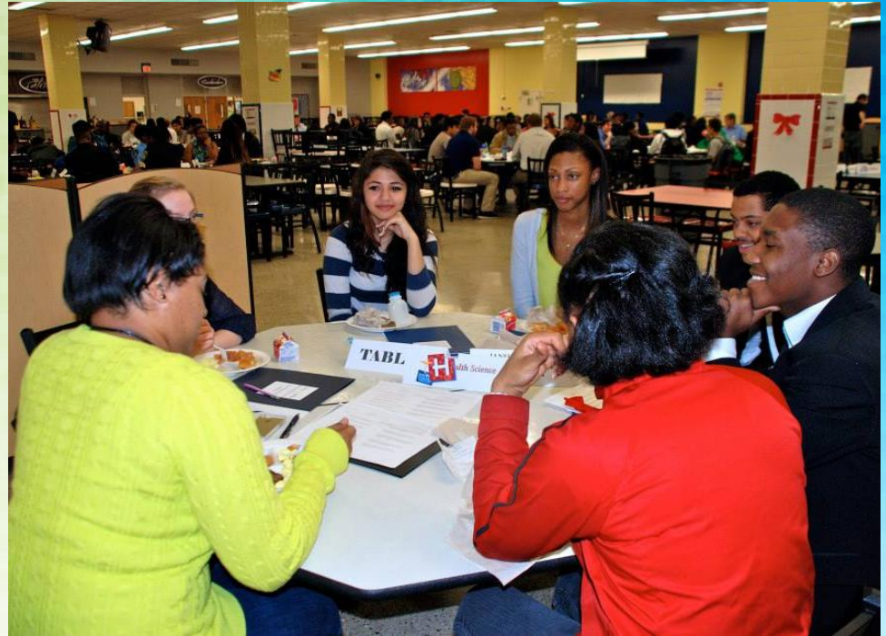
Students and professionals discuss workplace preparation at a Career Day breakfast.