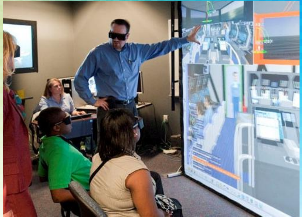
Students explore high-tech design careers at Newport News Shipbuilding.