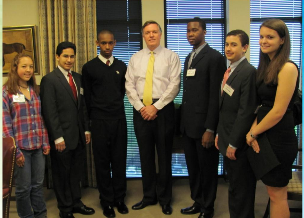
Ferguson Enterprises hosts students for one-day mini internship during Spring Break.