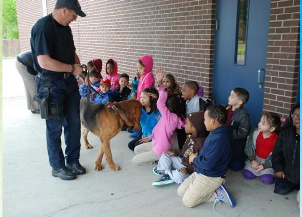
The NN Police K-9 unit visits a school during Career Day.