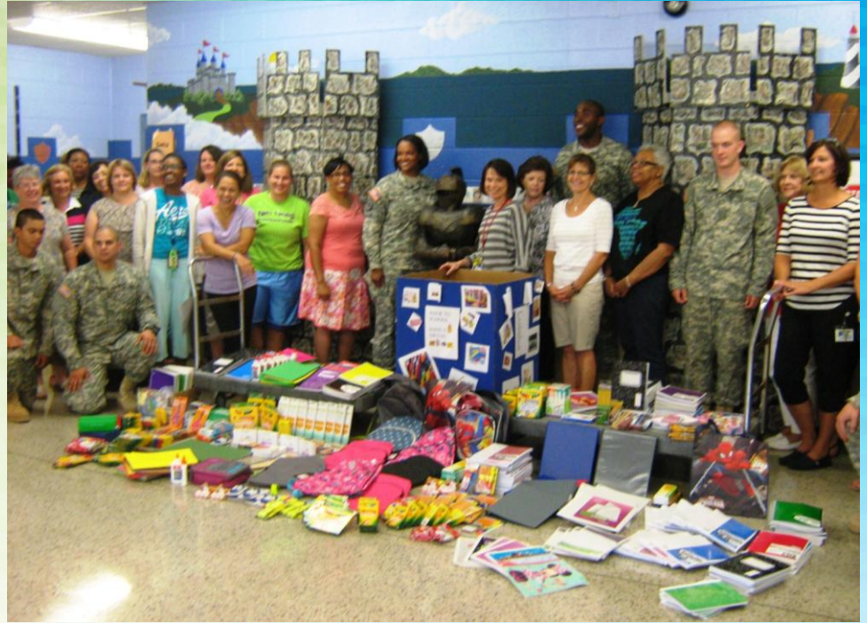
Solders from Fort Eustis collected school supplies for students at R.O. Nelson Elementary School.