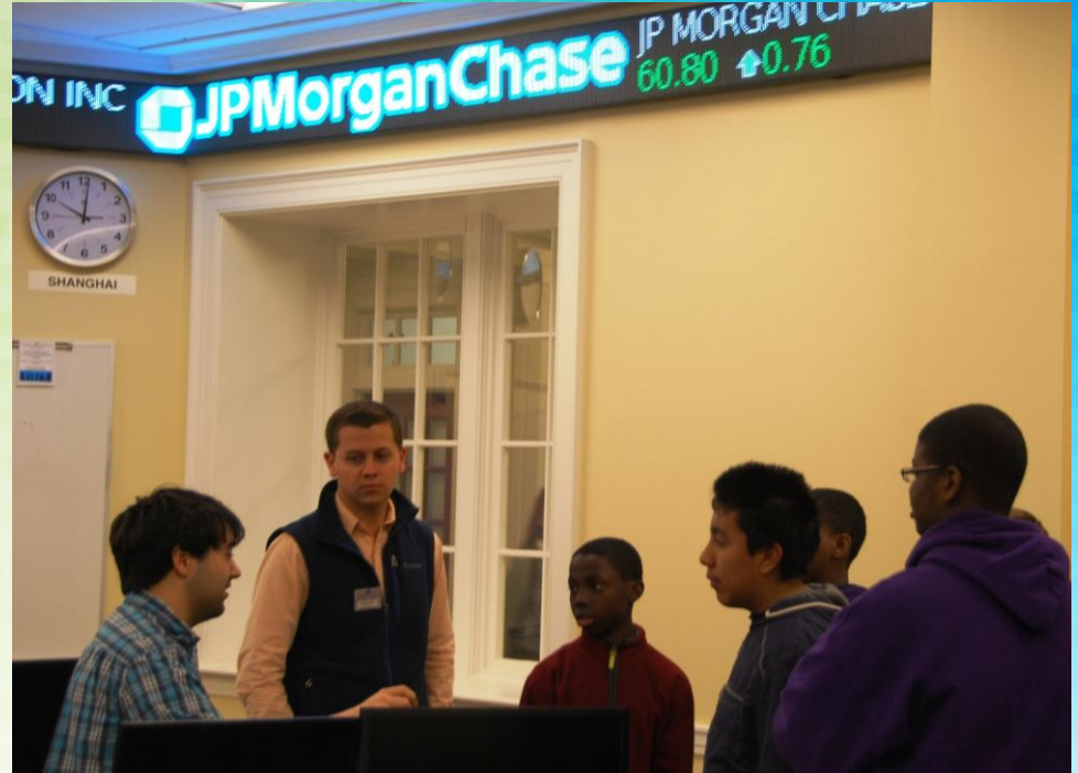
Students tour the School of Business at Christopher Newport University.