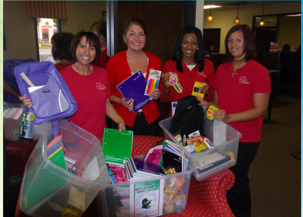
Virginia Educators Credit Union collects school supplies for students.