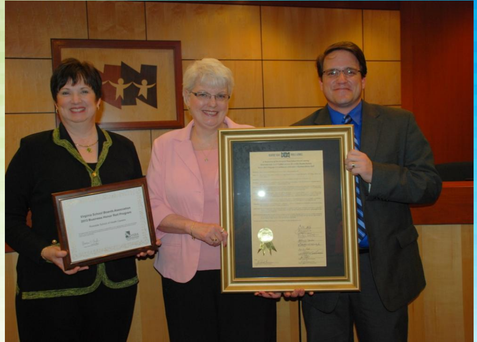
Riverside Health System staff accept an award for their work to prepare students for health care careers.