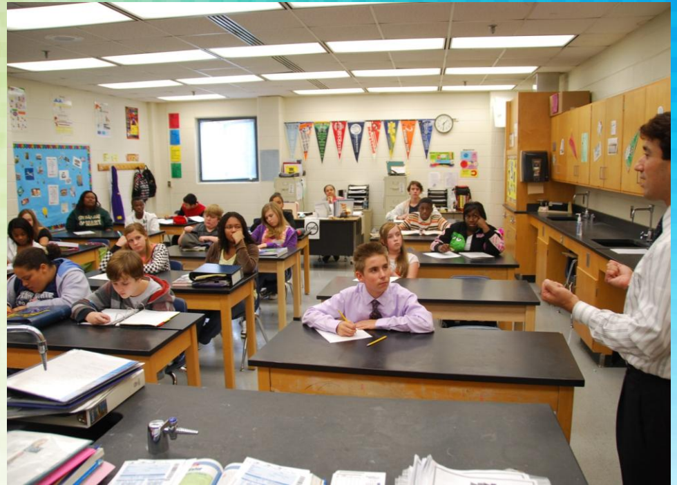
Middle school students take notes during a presentation on financial careers by a local banker.