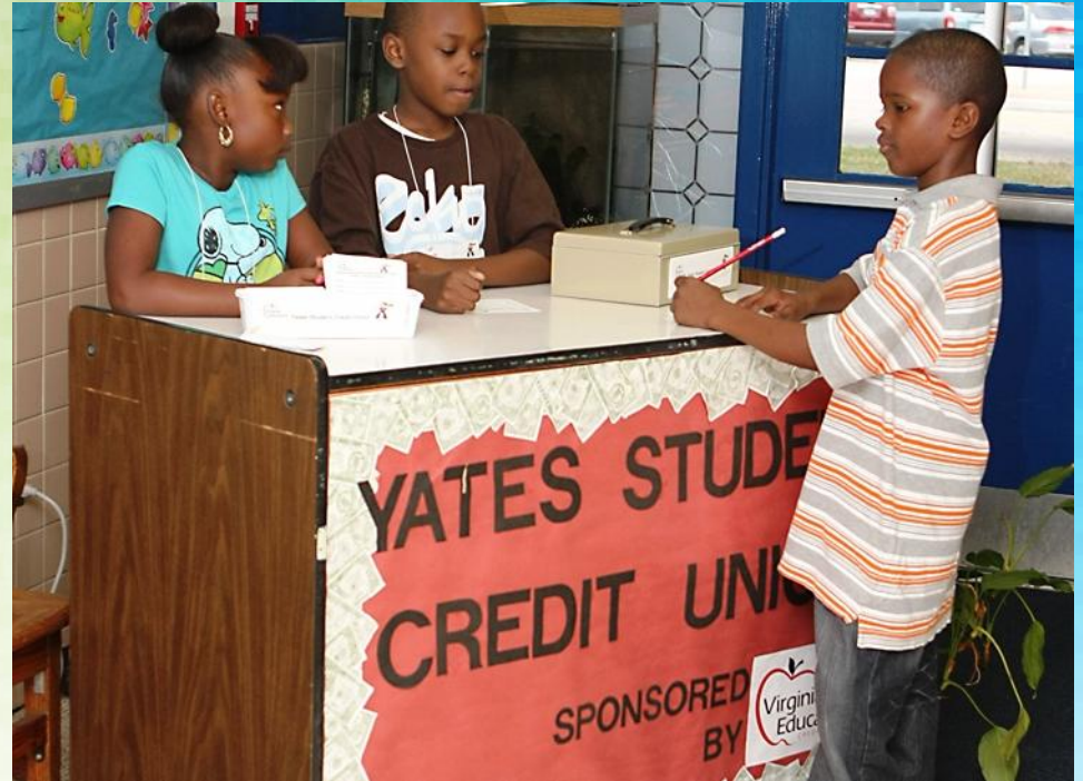
Virginia Educators Credit Union sponsors student branches at Yates Elementary and Menchville High