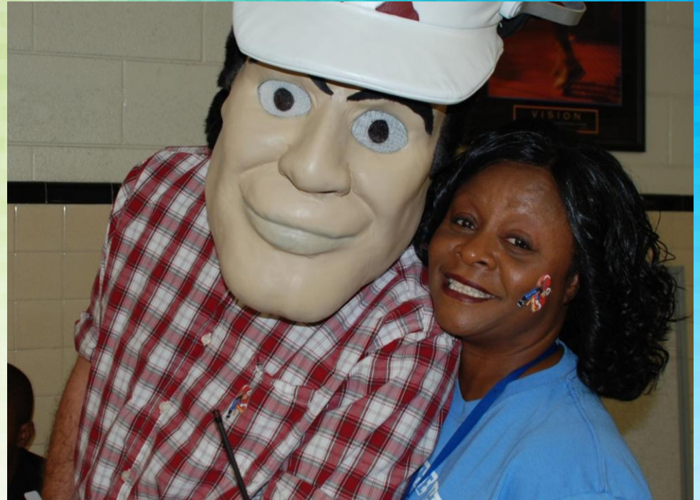
The Newport News Shipbuilding Apprentice School mascot makes an appearance at Huntington Middle School for a Career Pathways Activity.