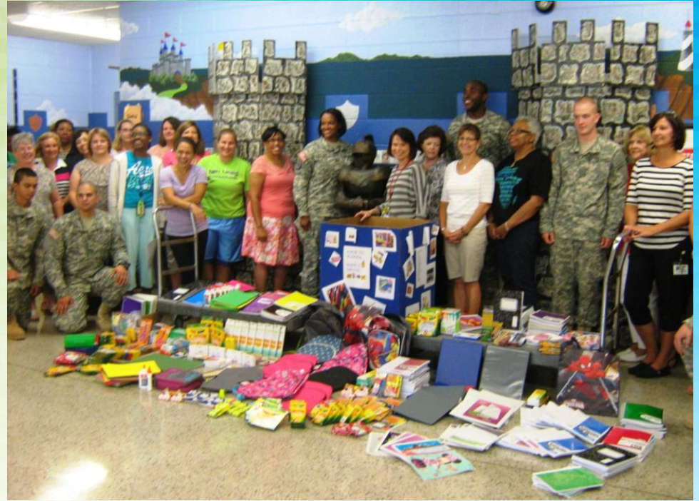
Solders from Fort Eustis collected school supplies for students at R.O. Nelson Elementary School.