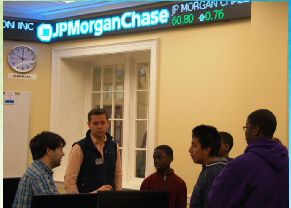
Students tour the School of Business at Christopher Newport University.